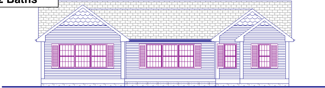
Front Elevation View