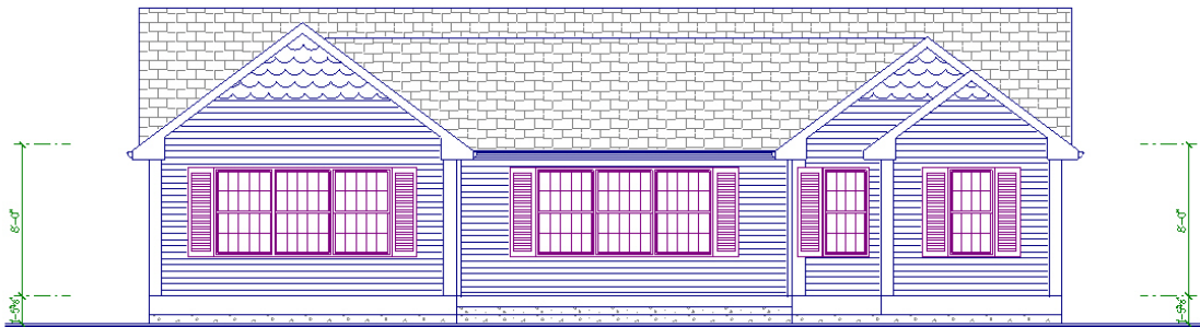
Rear Elevation View