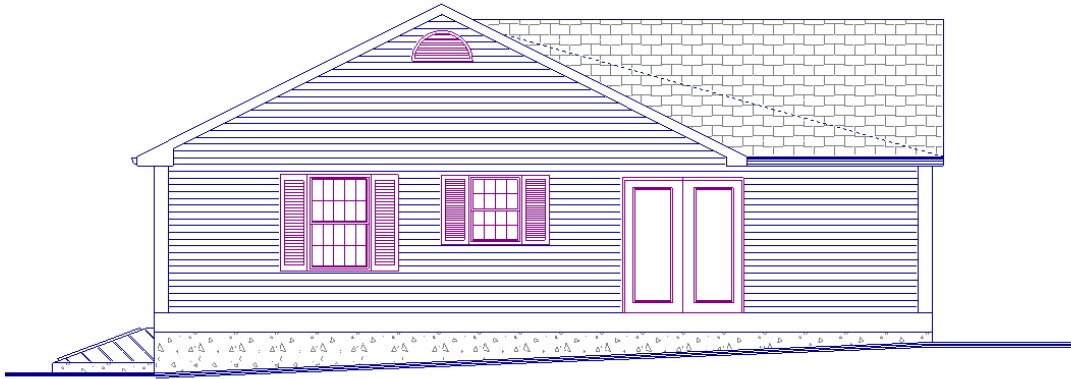
Left Side Elevation View

244 Upton Road Colchester, CT 06415 1-888-820-0409 www.JenmarAuctions.com